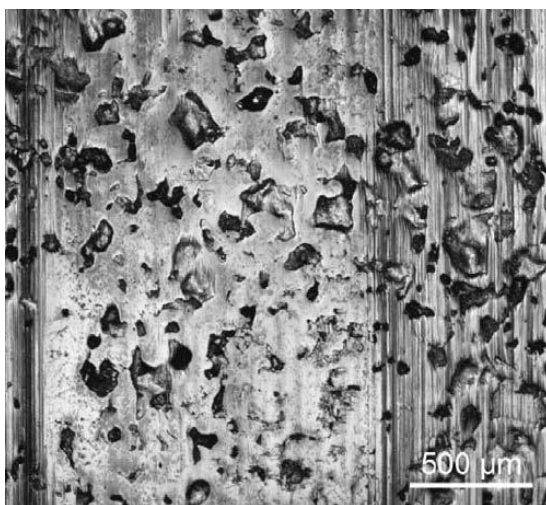
Figure 2. The picture of a wear track on a treated 12X13 steel surface performed by means of an optical microscope ( T=120^\circ\text{C} , P=1.5 GPa, 10 million cycles, slip-rolling).

Figures 2 and 3 clearly demonstrate that after 10 million cycles of slip-rolling abrasion test the surfaces with mineral coating, exposed to friction, became smoother. It is possible that the technology of creating a thin modified layer on a metal surface, leading to its local strengthening and enhanced hardness [4], preconditioned good slip-rolling friction resistance of the samples made of 12X13 and 11X15 (Russian equivalent of 102Cr6 German steel) steels, which was probably defined by general residual compression stresses.